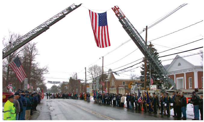
Coordinating patriotic community events is one way to keep your post visible.