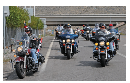
The American Legion Riders represent one of the fastest growing membership segments of the nation's largest veterans service organization.

to seek out and invite potential members to join. Be sure to give them the Legiontown , USA and Four Pillars booklets and answer their questions. Parents, teachers, first responders, business owners and employees, retirees and National Guard and Reserve troops will all see the advocacy and service of The American Legion during your Legiontown campaign and should be honored to carry the title of Legionnaire. Just ask them.