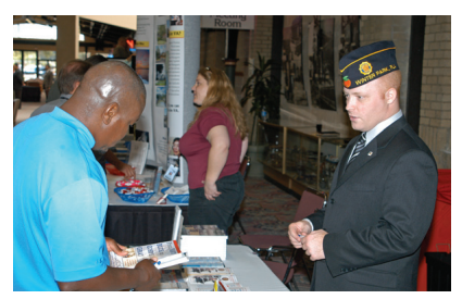
Assisting veterans to obtain earned benefits and holding local job fairs provide valuable services and attract both veterans and their families.

Veterans Service Day. Coordinate with your district commander to hold an area-wide event to include a job and benefits fair for all area veterans and their families. Invite elected officials and have activities for children. Combine resources with other posts, if feasible for your area, to facilitate a larger scale event. The free publication, Veterans Service Days , from the national headquarters public relations office provides details. Consider holding the event the week before Veterans Day.