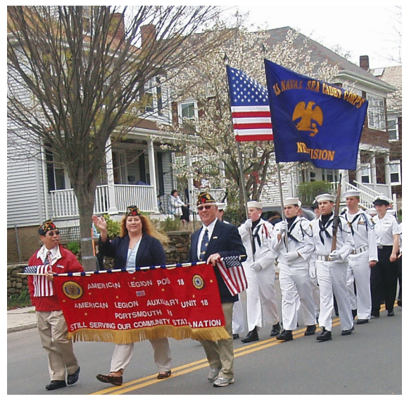
Making your town a Legiontown requires visibility, service and commitment.